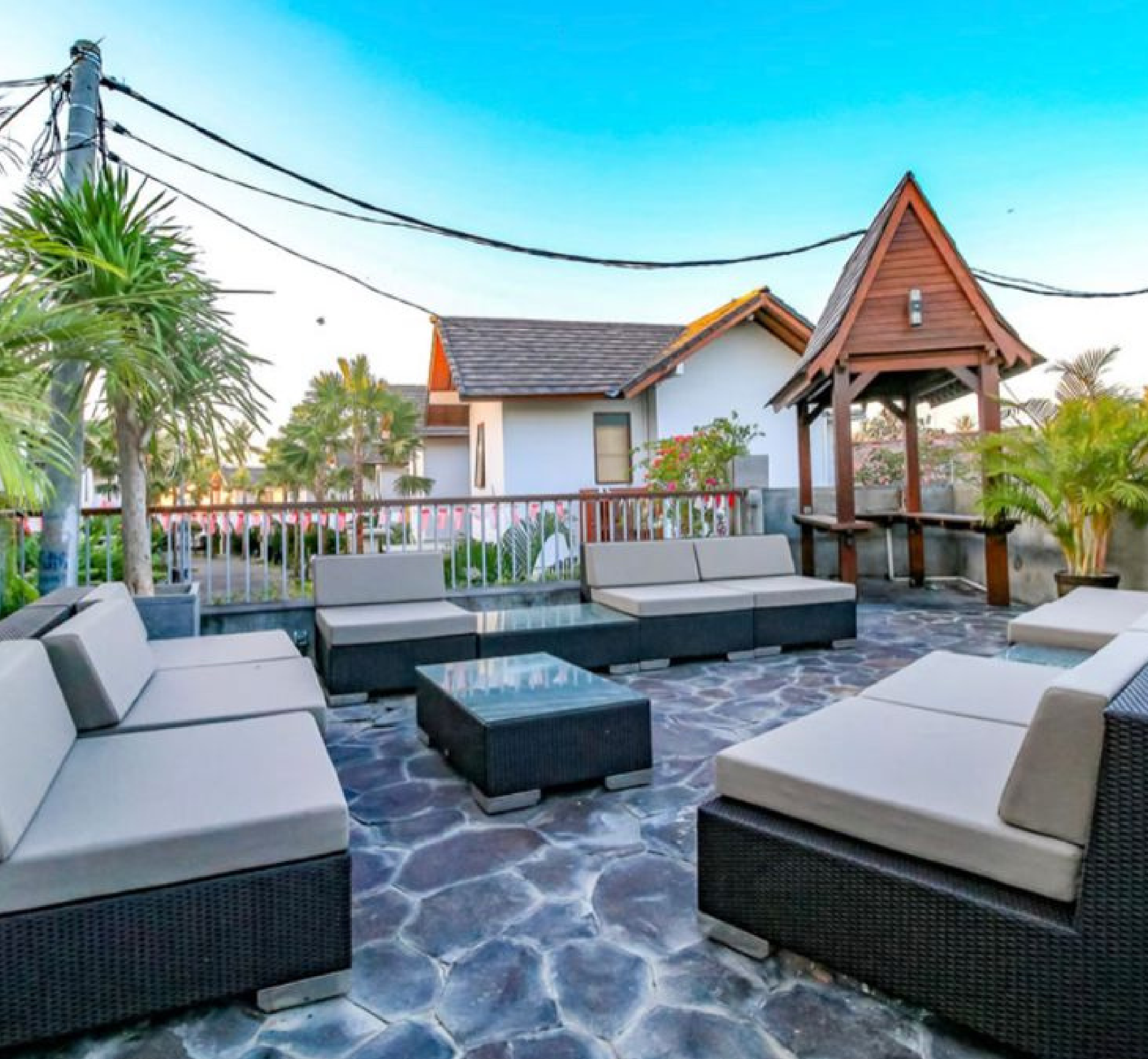
Picture of Hotel common areas