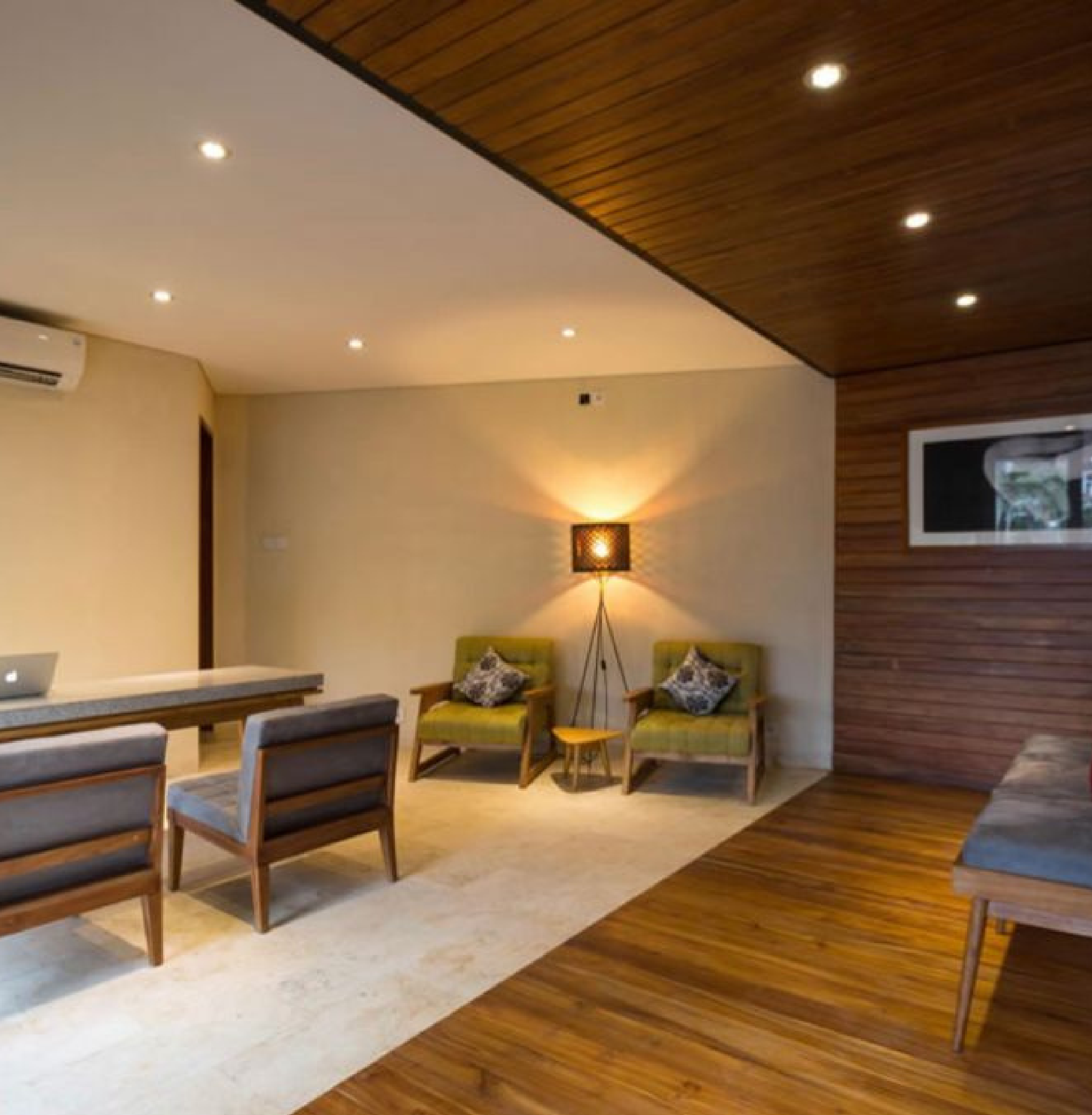
Picture of receptionist and lobby Hotel