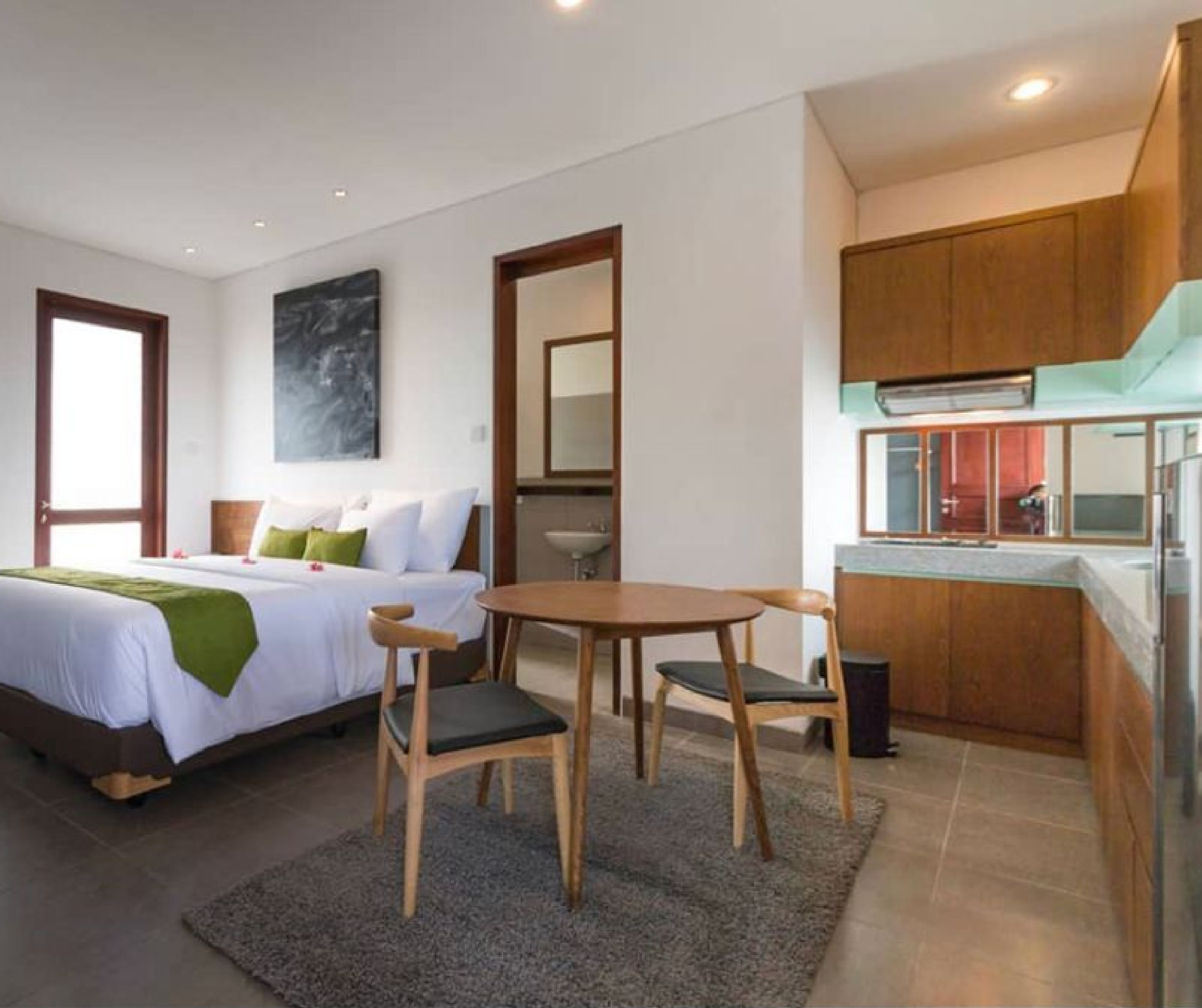
Picture of studio room