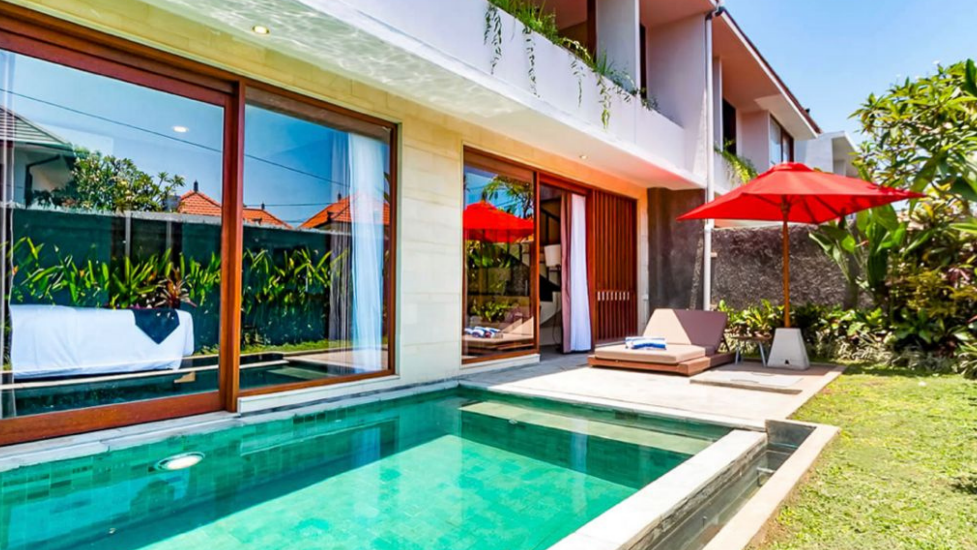
Picture of Two bedroom Villas